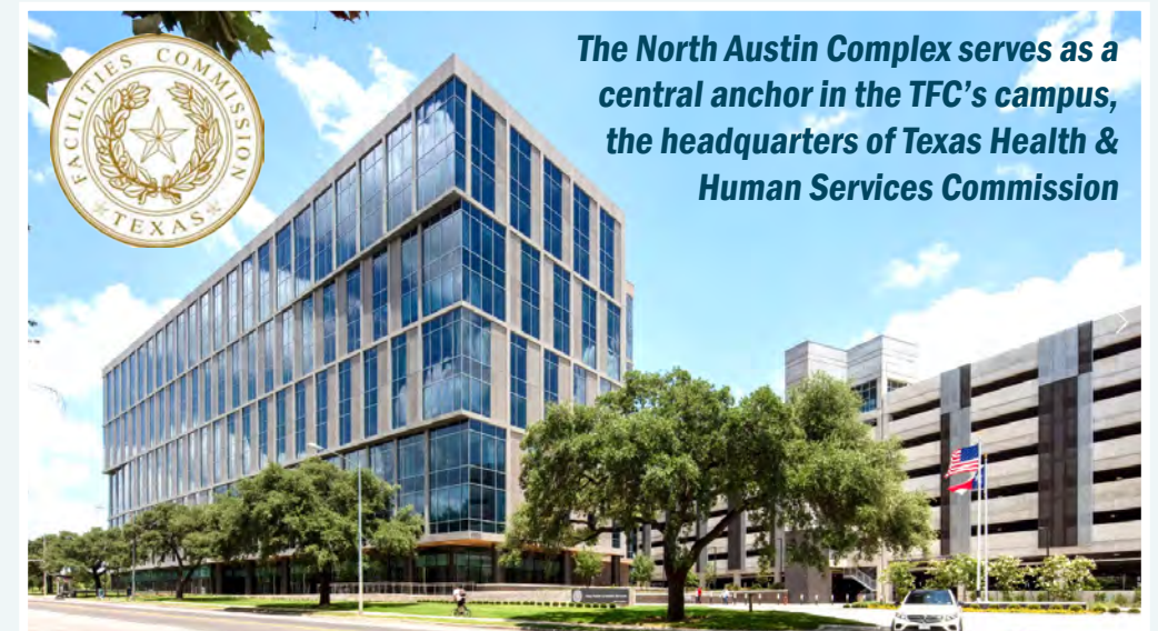
The North Austin Complex serves as a central anchor in the TFC's campus, the headquarters of Texas Health & Human Services Commission

Click here to view previously conducted TFC meeting minutes and agendas