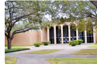
Less than 4 miles from the subject property

Coastal Bend College Beeville , founded in 1965 as Bee County College, is a public community college offering associate degrees, certificates, and workforce education programs. Accredited by SACSCOC, it prepares students for transfer to four-year universities, provides specialized technical training in fields like electronics, drafting, and business, and offers a wide range of avocational and continuing education courses. With a strong commitment to lifelong learning, the college also supports workforce development, community enrichment, and student engagement through academics and athletics, serving 5,091 students.