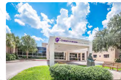
Less than 2½ miles from subject property

Christus Spohn Hospital Beeville is a 49-bed full-service acute care hospital, providing comprehensive medical services including emergency care, general surgery, pediatrics, labor and delivery, rehabilitation, and critical care in its ICU. The hospital is equipped with advanced diagnostic imaging technologies such as MRI, CT scans, ultrasound, mammograms, fluoroscopy, and nuclear medicine to support accurate diagnosis and treatment. Offering both inpatient and outpatient care, the facility specializes in routine and high-risk deliveries, pediatric emergencies, stroke and cardiac care, and recovery-focused rehabilitation programs.